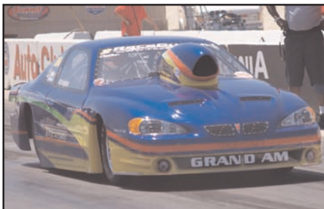
Ron Weems showed the So Cal Super E gang that some racecars do have doors