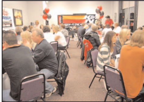
The banquet room at SpeedZone was filled to capacity with festive Super E racers and supporters.